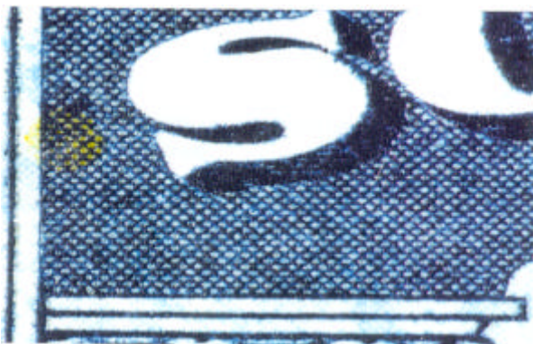
“The Feel of Steel”