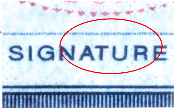
Micro-printed signature line